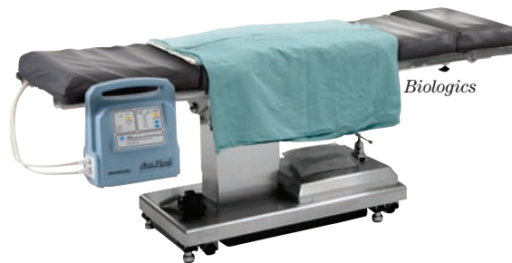
▲ AFLOAT IN THE OR The Dolphin Pad system automatically measures the weight and surface area of each patient and adjusts the density of air in the mattress to simulate buoyancy.

Studies have shown one of the most common sites of surgical pressure injuries is the heel, and many of the advanced pressure redistributing technologies discussed above do not seem to be doing much to prevent intraoperative pressure ulcers that develop at this particularly vulnerable site. Why? For one, the heel doesn’t have a lot of natural padding to protect it from external pressure. Secondly, when the body sinks down into an air mattress, the heel acts as a fulcrum. Research has shown that heels endure a high level of pressure on standard OR table pads and even on more-advanced viscoelastic pads.