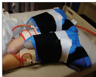
▲ SORE SPOT Heel offloading devices like this padded boot help protect one of the body’s most vulnerable pressure points.

What if the experience of lying on a surgical table were as smooth and comfortable as floating in a pool? That’s the idea behind fluid immersion simulation technology, originally developed by engineer Mark Hagopian in the 1990s for the U.S. Navy to safely transfer dolphins without damaging their internal organs. The Dolphin Pad, adapted for use in the OR, is similar to a standard air mattress system, except it’s connected to a computer algorithm that, when a patient is placed on the pad, automatically measures the density, weight and surface area of the patient’s body and precisely adjusts the density of air in the mattress to simulate buoyancy. Any time the patient’s position on the pad changes, the computer automatically responds and re-profiles the air in the mattress to keep the fluid immersion simulation intact. The pads can hold up to 900kg.