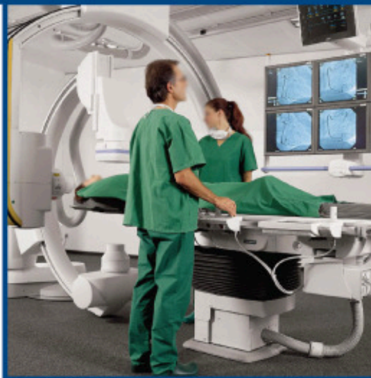
~ Totally Radiolucent Surface ~

FOAM PADS, GEL PADS, VISCO ELASTIC PADS, it is what it is, no matter how great the marketing, you can not change the laws of Physics, Mechanics and/or the Human Hemodynamic System... It's all about Microvascular Blood Flow!!! Without it living tissue dies.